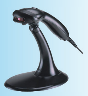
USB Barcode Scanner (online)